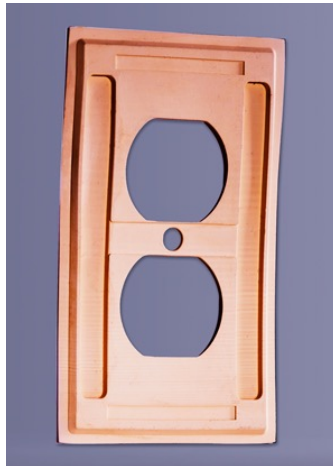
Figure 1: Front View